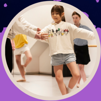
SOUTHERN FEDARATION OF DANCE EXAMS